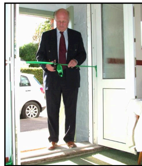
Sir Jim Paice MP,

A real buzz was created with the opening of the new community rooms at Teversham Chapel on Saturday 7 th September. Sir Jim Paice MP, joined representatives from the District Council, Parish Council, church members and around 60 other local residents