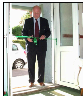
Sir Jim Paice MP,

A real buzz was created with the opening of the new community rooms at Teversham Chapel on Saturday 7 th September. Sir Jim Paice MP, joined representatives from the District Council, Parish Council, church members and around 60 other local residents